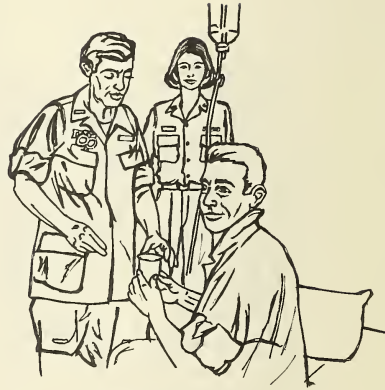
VIETNAM WAR 1961-1973